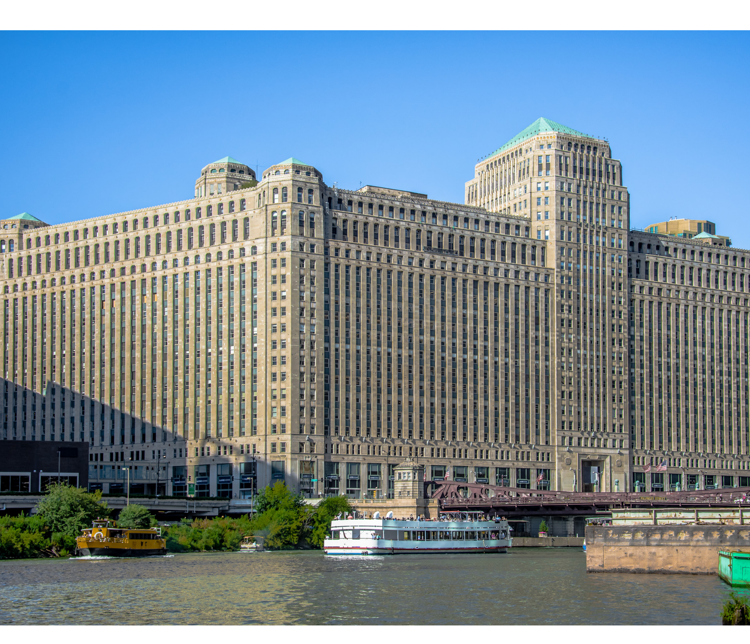
Merchandise\ Mart\ |\ Architect:\ Graham,\ Anderson,\ Probst\ and\ White\ |\ Style:\ Art\ Deco\ |\ Opened:\ 1930

When it was completed in 1930, the Merchandise Mart was biggest building in the world in terms of total area. The 4,000,000-square-foot building has its own zip code and has in recent years become the center of Chicago's tech renaissance.